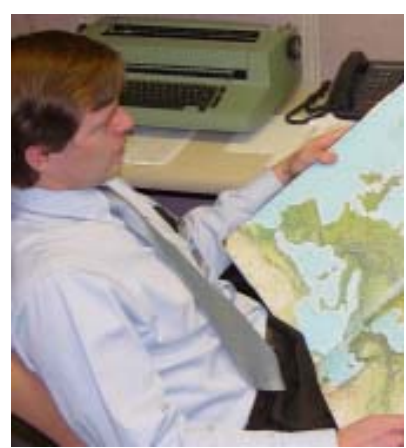
ignored her as he pondered a trip to India.